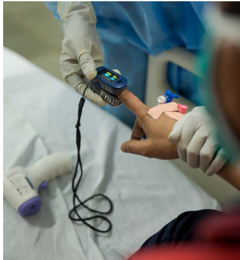
Mumbai, India - ©Abhinav Chatterjee/MSF

(manometers), nasal cannulas and prongs. Measures to increase oxygen supply must also take into consideration the medical materials needed to effectively deliver oxygen to the patient, including oximeters to monitor them and skilled staff to maintain or repair the devices if they break.