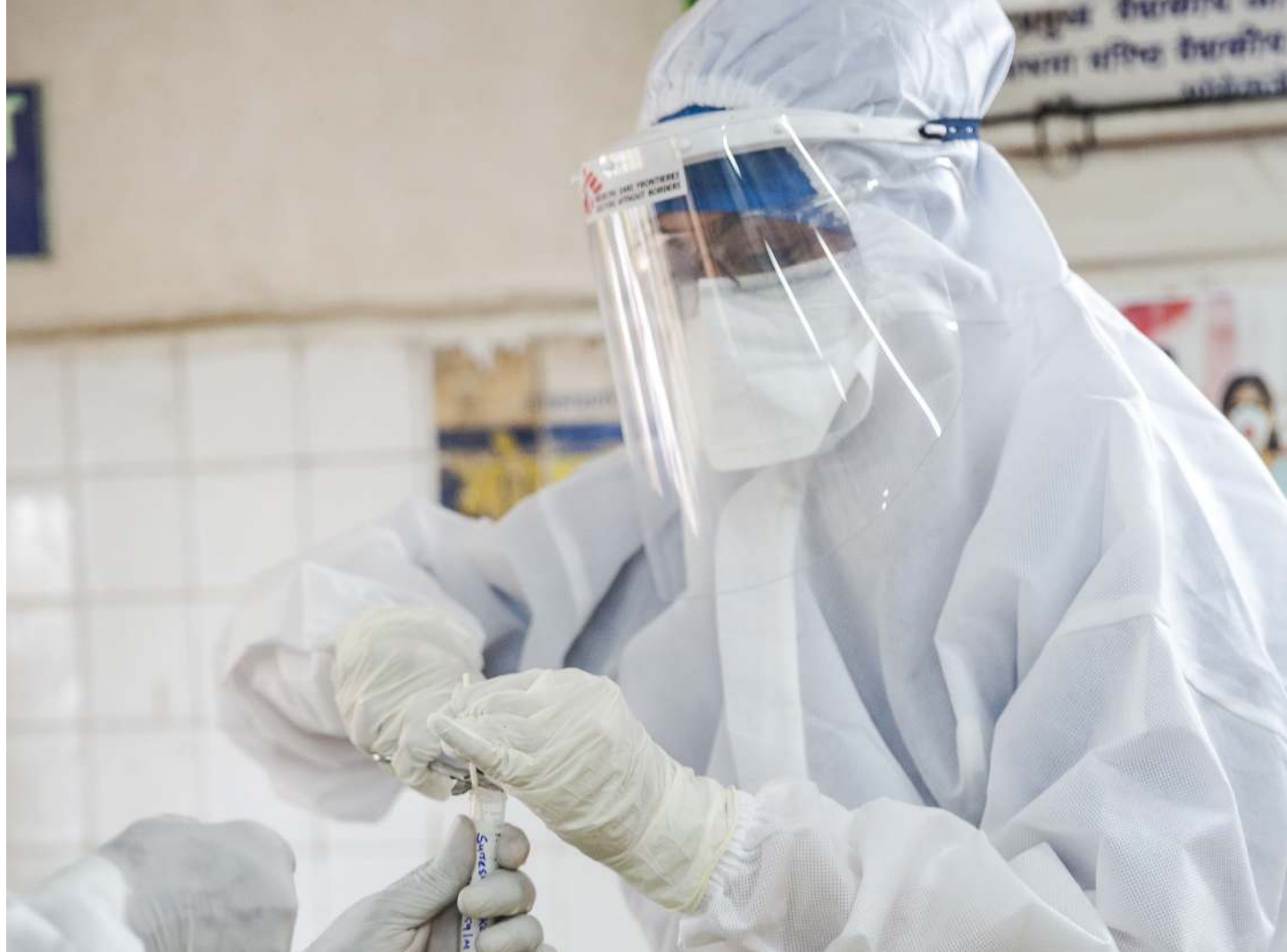
Mumbai, India