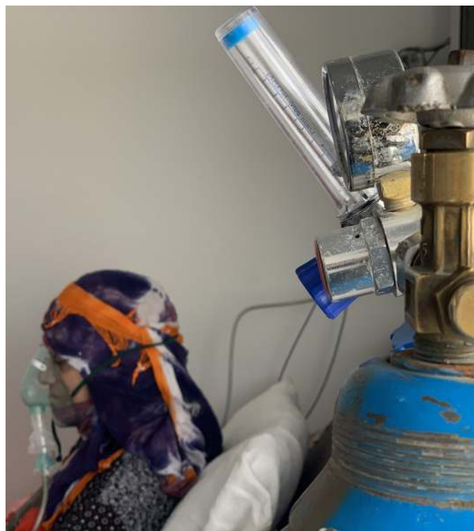
Sana'a, Yemen

The COVID-19 pandemic has exposed pre-existing shortages of medical oxygen, and the inequalities in access to what WHO considers an 'essential medicine'. Not every COVID-19 patient has the same chance of survival, in part based on their ability to access oxygen – the most essential of treatments.