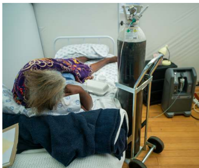
Khayelitsha, South Africa

Health workers in places where MSF encountered shortages in medical oxygen expressed their high levels of distress at having to ration oxygen, which has included deciding who should be prioritised for treatment. Their distress is compounded by the fact that oxygen is an essential medicine.