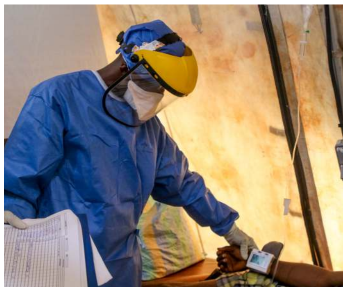
Kinshasa, DRC

The Kinshasa team was able to identify multiple suppliers of oxygen. This was necessary to avoid being dependent of one oxygen plant, which, if it broke down, would have left them without an oxygen source. This was the experience of MSF teams in Brazil, where a private company provided oxygen to multiple states via its three plants in Manaus. When state authorities reported that two of the plants had broken down, supplies were affected across multiple states in the region.