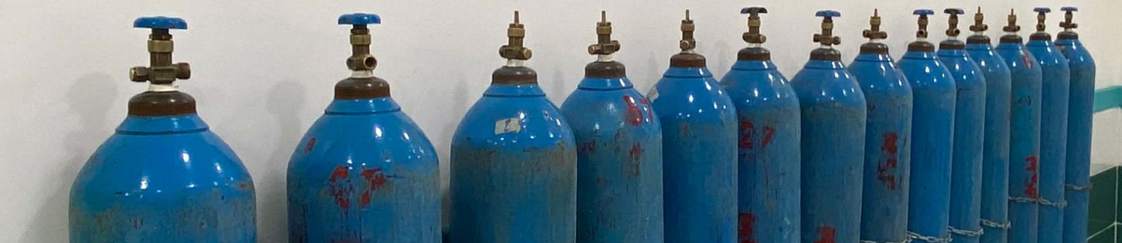
Aden, Yemen