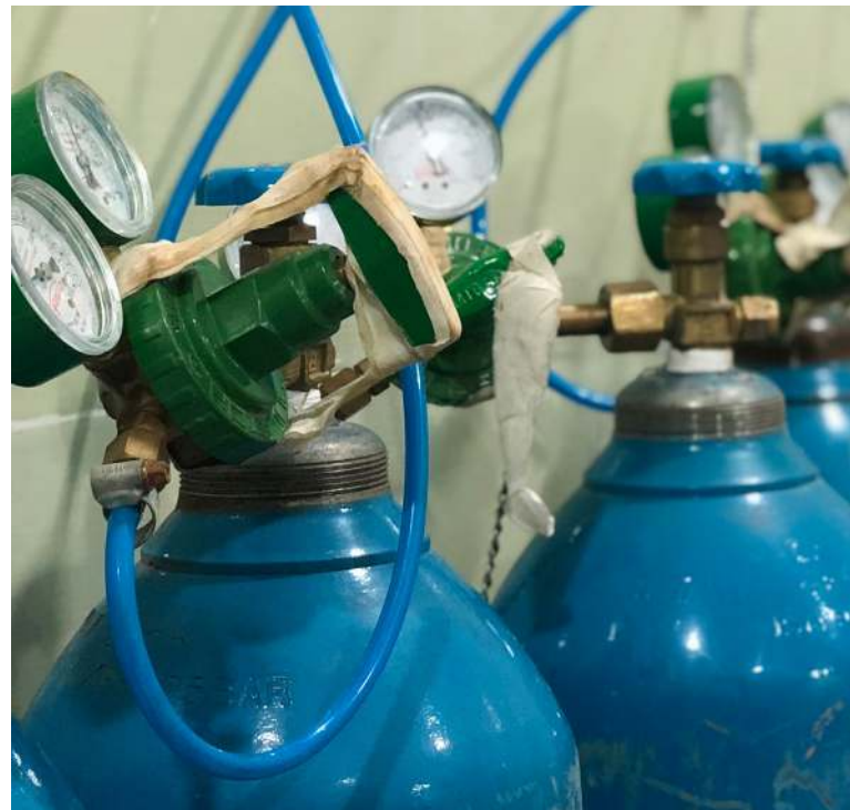
Aden, Yemen

Only one in five people with COVID-19 symptoms suffers respiratory distress sufficient to require oxygen therapy. As COVID-19 patient-care protocols have evolved, medical oxygen is considered essential for the treatment of these patients. They can receive oxygen through normal and high flow oxygen therapies and/or through invasive ventilation. Studies show that early and adequate access to oxygen