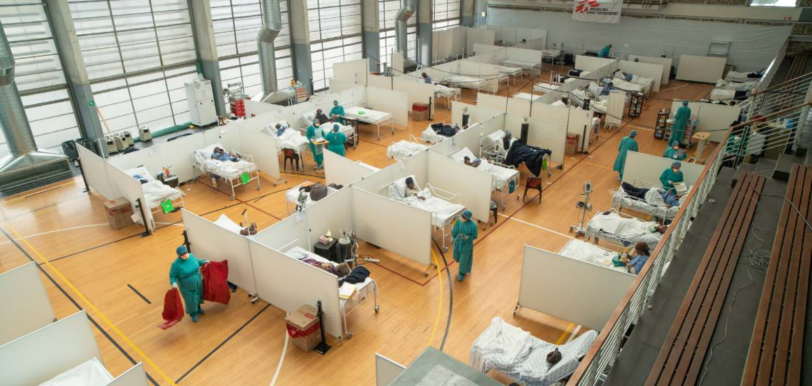
Khayelitsha, South Africa - ©Rowan Pybus/MSF

In Lesotho, the lack of oxygen plants led to similar challenges during the second wave in January 2021. Medical staff were forced to share devices with more than one patient. This limited the amount of oxygen they could provide to each patient and reduced the capacity of medical teams to increase the oxygen flow if necessary.