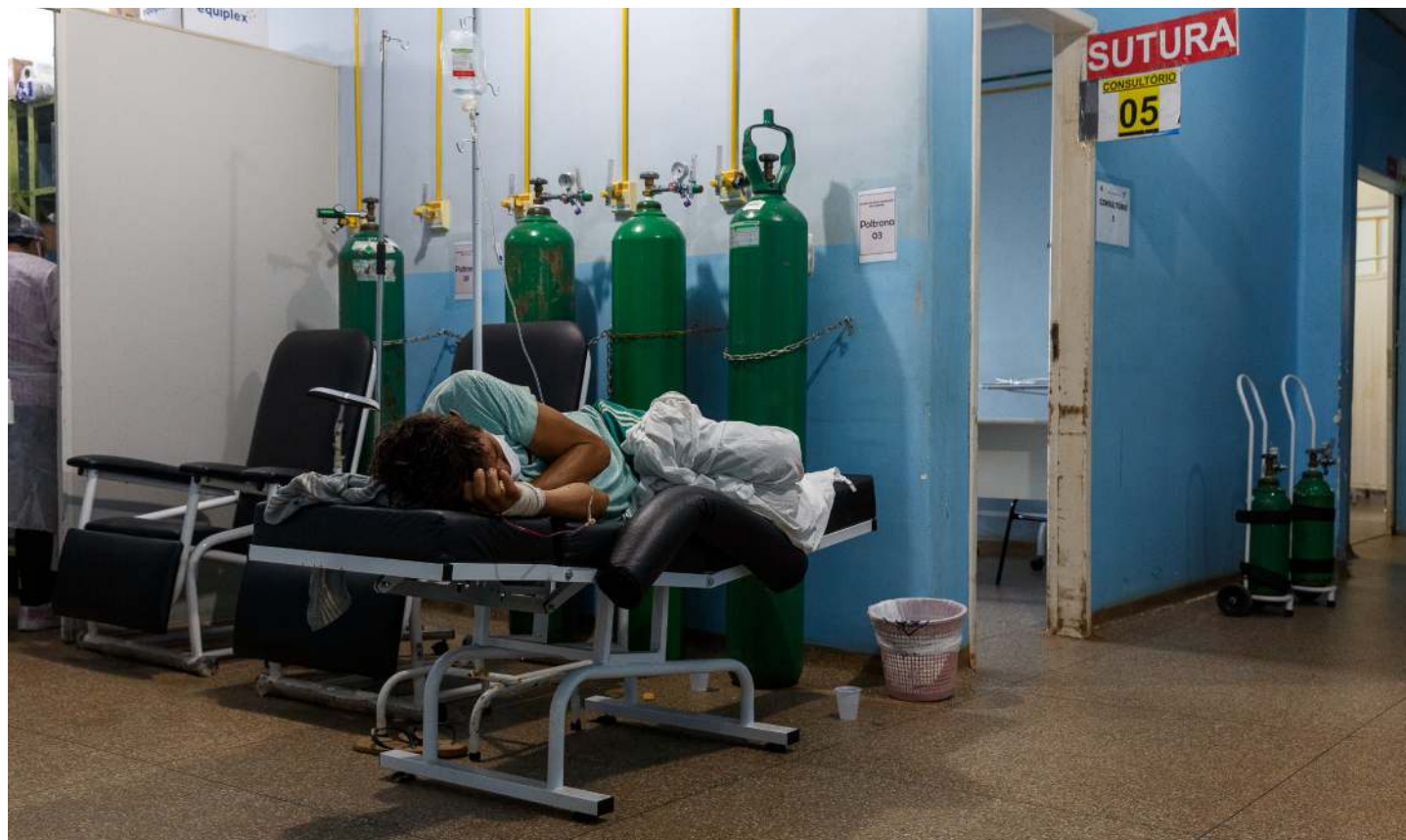
Porto Velho, Brazil